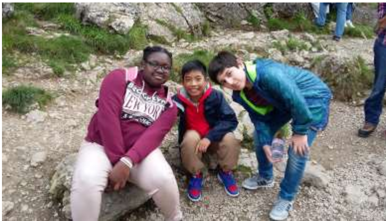
PDS students – Peak District 2016