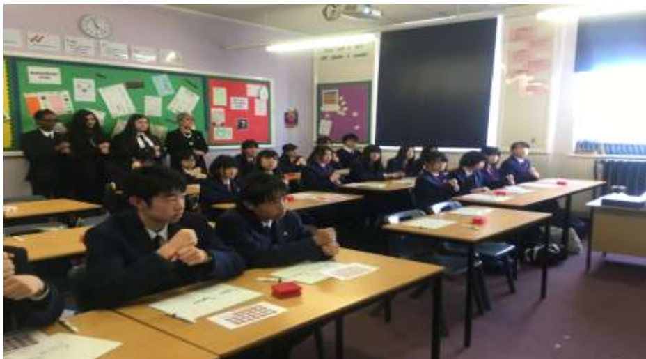
Students visiting from Japan having a sign language lesson

We also provide a 'Deaf Awareness' programme to all new Year 7 students as part of their mainstream Smart Futures curriculum.