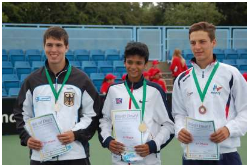
PDS student (middle) receiving gold medal at World Deaf Under 18's Tennis Championship 2017