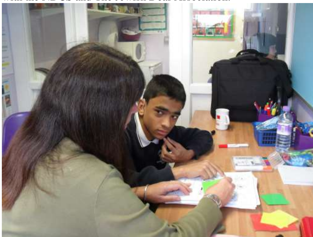
Speech and Language therapy session

We encourage opportunities for the deaf students to meet with other deaf people by promoting organisations such as Friends of Young Deaf, London Disability Sports Forum and local sign language classes and Deaf youth clubs. We have links with the NDCS and The Jewish Deaf Association.