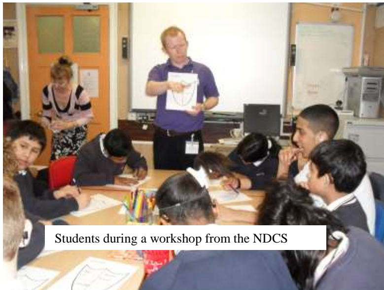
Students during a workshop from the NDCS

The deaf students have opportunities to meet their deaf peers through the week within mentoring time and at lunchtimes.