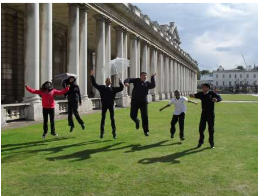
PDS students having fun on a trip to Greenwich

We currently have eleven deaf students in Years 8 to 13, with hearing losses ranging from severe to profoundly deaf. All students wear post-aural hearing aids, or have cochlear implants and have access to radio aid systems for lessons. The school has Soundfield systems in over fifty classrooms, which allows teachers' voices to be heard more clearly. Additionally, in each class room and in corridors around the school, there are flashing light indicators to signal lesson transitions.