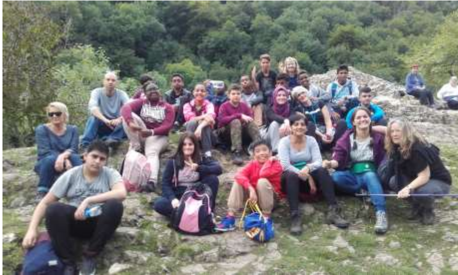
PDS students and staff enjoying the scenery in the Peak District 2016