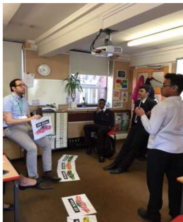
RAD 'Money works' workshop 2018