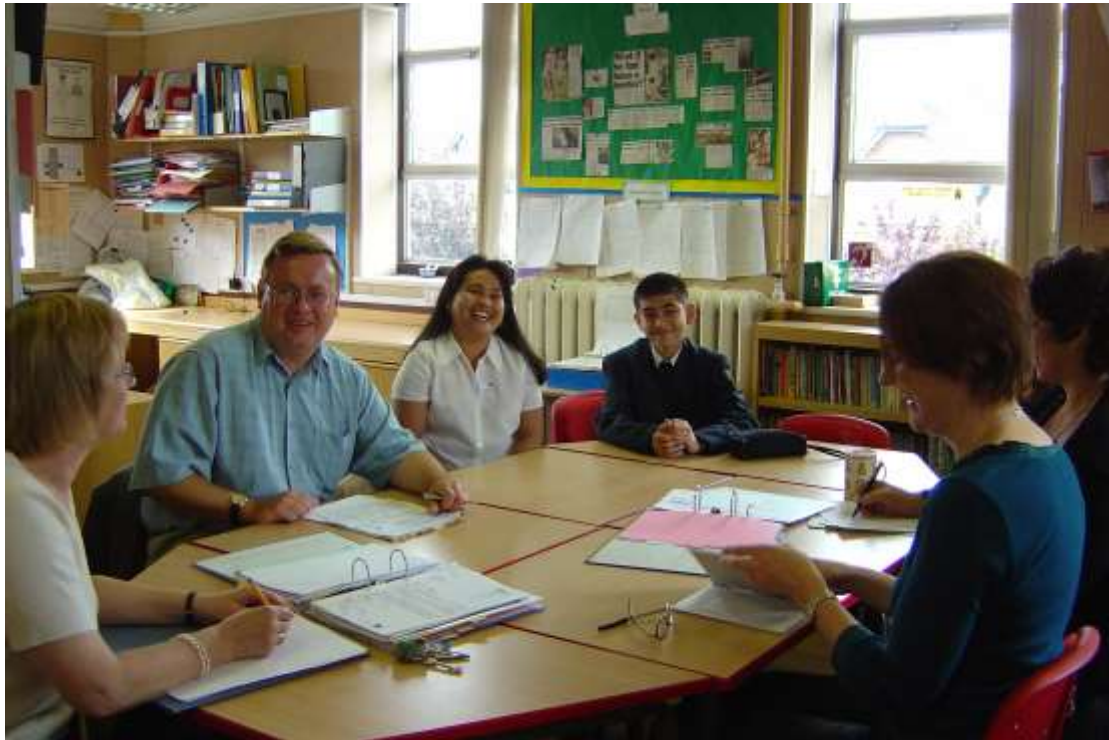
Parents, student and teachers meet for an Annual Review

We encourage parents to contact the PDS to discuss any matters as soon as they arise.