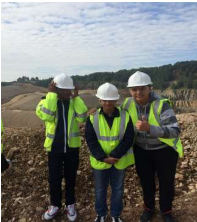
PDS students at a Limestone Quarry, Derbyshire 2016

Many of our students also participate in activities outside of school, including sports clubs and teams, including football, swimming, Taekwondo and tennis. These students have had fantastic success in their respective sports, with one of our former students becoming the World Deaf Under18's Tennis champion, representing Great Britain!