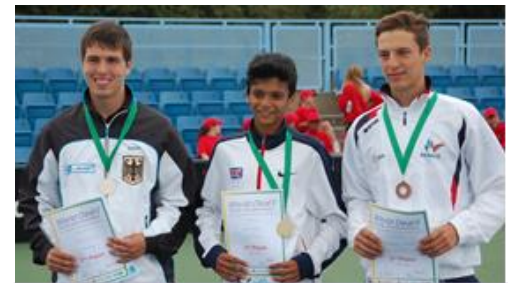
1 st - Great Britain 2 nd - Germany 3 rd - France