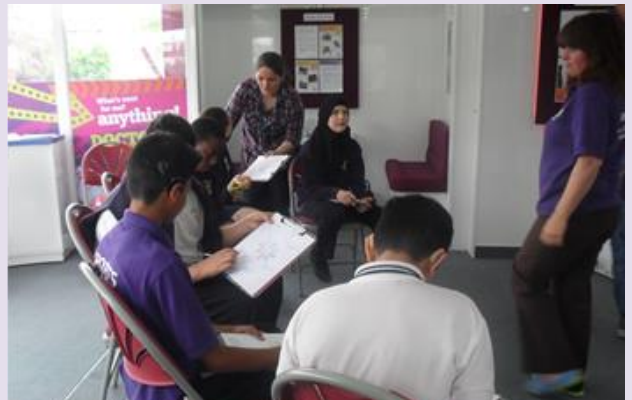
They wrote down about their identity and learnt about technology