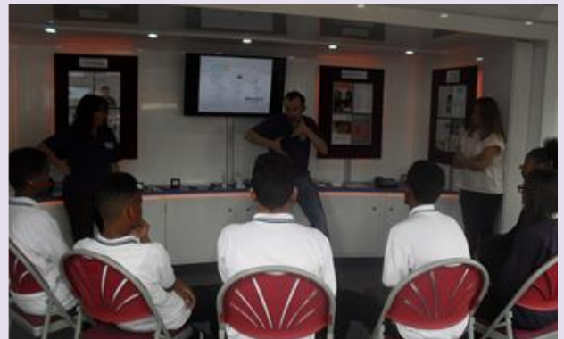
They learnt many things like 'Who am I' and technology for their independence